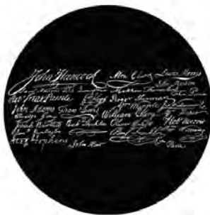
82866 Independence 1

While I'm typically against using projected gobos that are meant to represent "real things," this seemed like the perfect moment for such an effect. Scenic Designer Stephen Dobay and I discussed projecting all the signatures on the back wall of the set. He created the artwork and we refined the shape and size to make the text feel organic but still recognizable. We originally considered trying to use Rosco iPro Image Projectors, or print our own artwork, possibly in conjunction with an LED source so as to not overheat the acetate. Ultimately, we decided it was best to have the gobos custom made in glass. The gobos were placed in a pair of ETC Source 4 26's, one on each side in a Box Boom from a low angle. As the church bells chimed, and each character crossed to sign the declaration, the gobos faded up in a long count, slowly revealing the names. In the final blackout, the image lagged for a beat, the continental congress disappearing into a sea of their own names. It was a great solution to creating one final surprise for the audience.