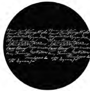
82867 Independence 2

Because 1776 is such a popular title for schools and regional theaters, R82866 Independence 1 and R82867 Independence 2 are both excellent new additions to the Rosco catalog. Thanks to Cory Pattak, these two glass gobo designs can now be found inside our library of Standard Gobos for everyone to use in their production of this beloved musical – or for use during Fourth of July events.